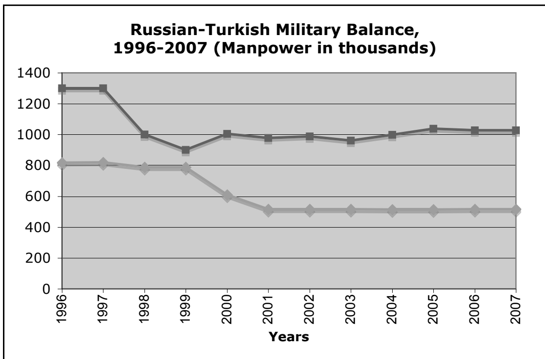
Graph 3. Russian (red) and Turkish (blue) Manpower in the Military, 1996-2007

Source: Data compiled from the Correlates of War Project 57