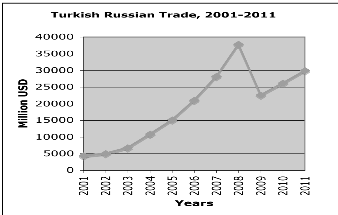
Graph 4. Turkish-Russian Bilateral Trade Volume, 2001-2011

Did Turkish-Russian relations worsen because of a significant retreat from a democratic regime in these two countries since 2002, as Democratic Peace Theory would predict? When we look at the Freedom House ratings of Turkey and Russia, we notice that Turkey's democracy rating did not change much at all between 2002 and 2011, whereas Russia's democracy rating only slightly worsened. Moreover, Turkey and Russia had the same govern-